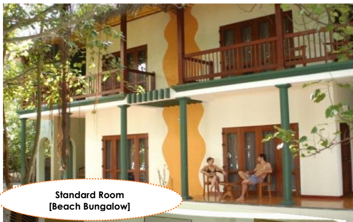
Standard Room [Beach Bungalow]