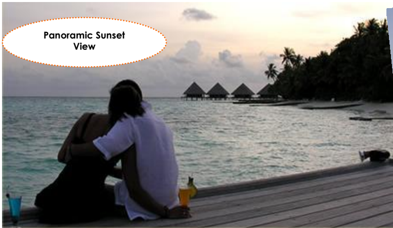
Panoramic Sunset View