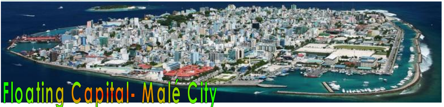
Floating Capital- Malé City

Tour Code: MD – 3B [Adaaran Club Rannalhi Resort]