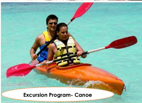
Excursion Program- Canoe